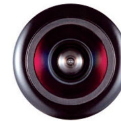
115° Wide angle CCD camera