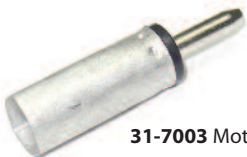
31-7003 Motorola Plug