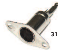
31-7005 Motorola Plug